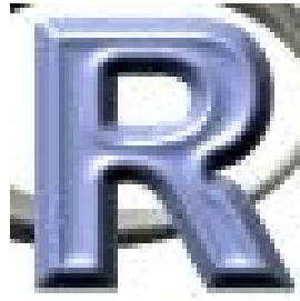
Figure 2: (clipped) Logo of R.

Users should note that "Raster*" -class data types are handled natively within the rpostgis raster functions. "Spatial*" objects are converted to/from "Raster*"s within the function execution; as such, there may be a performance benefit to working with "Raster*" objects.